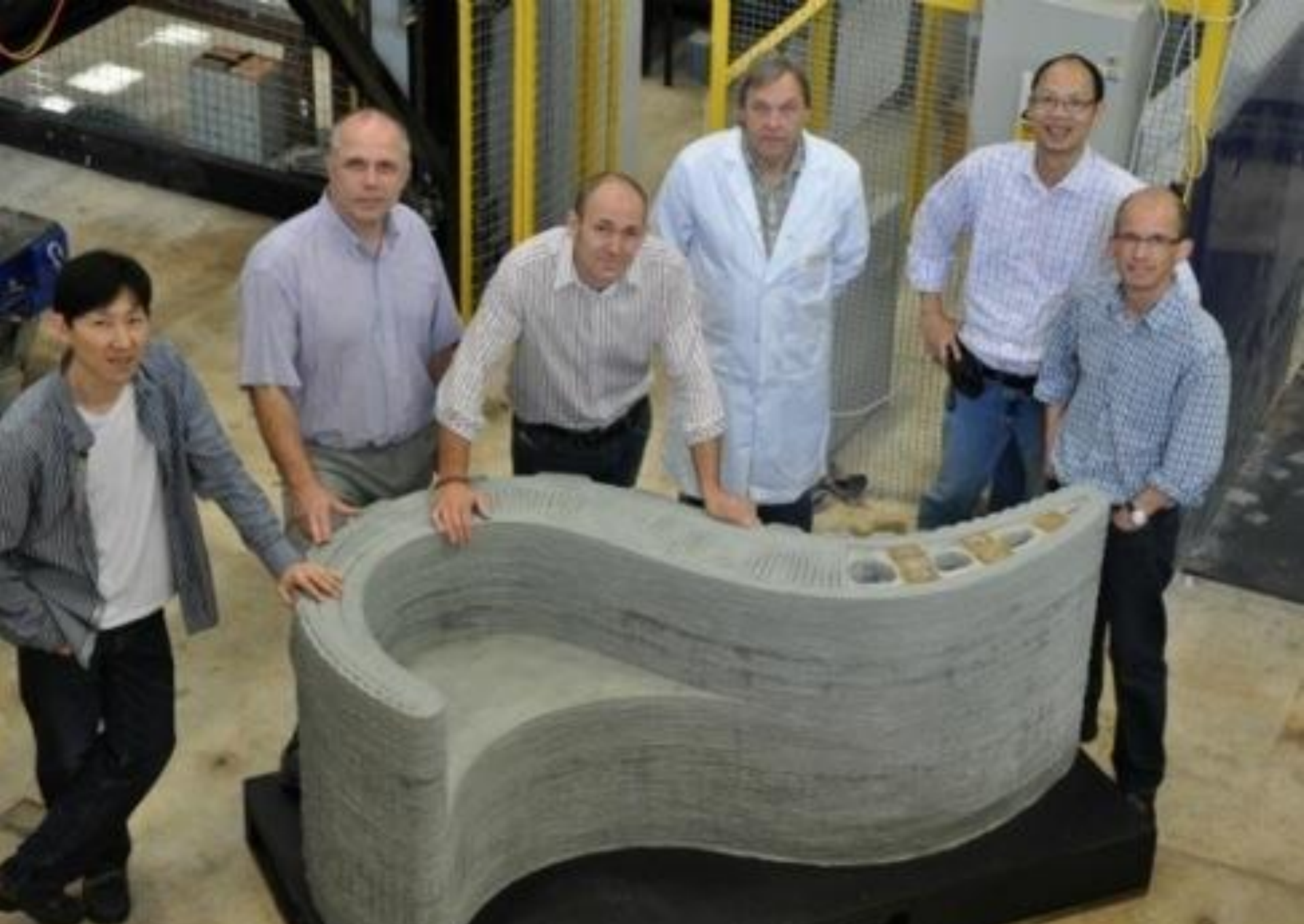
Curved Concrete – Loughborough University Project