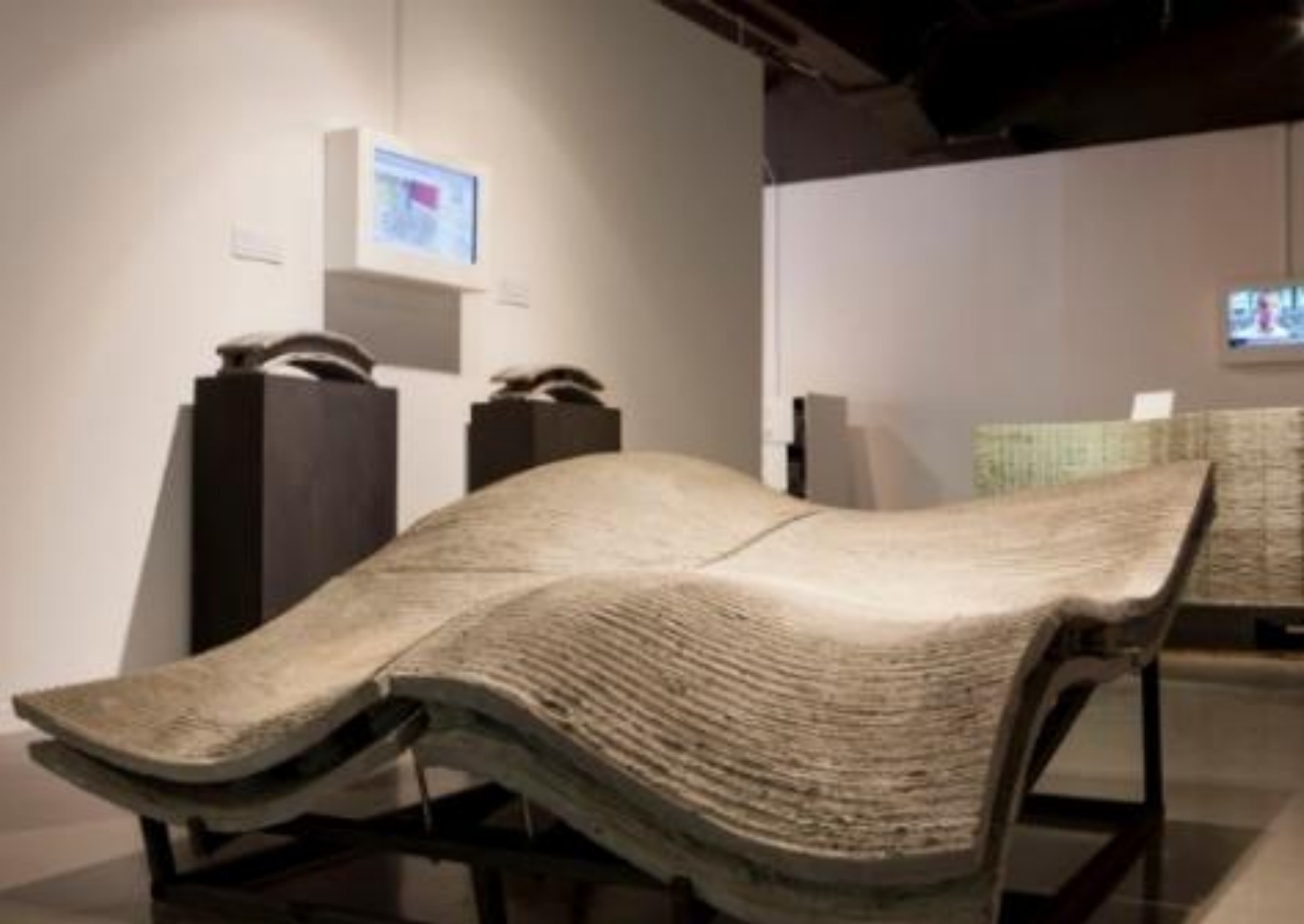
Printed concrete roof structure