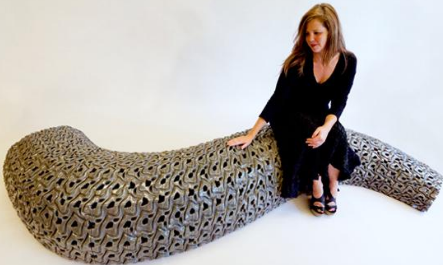
The Seatslug in use