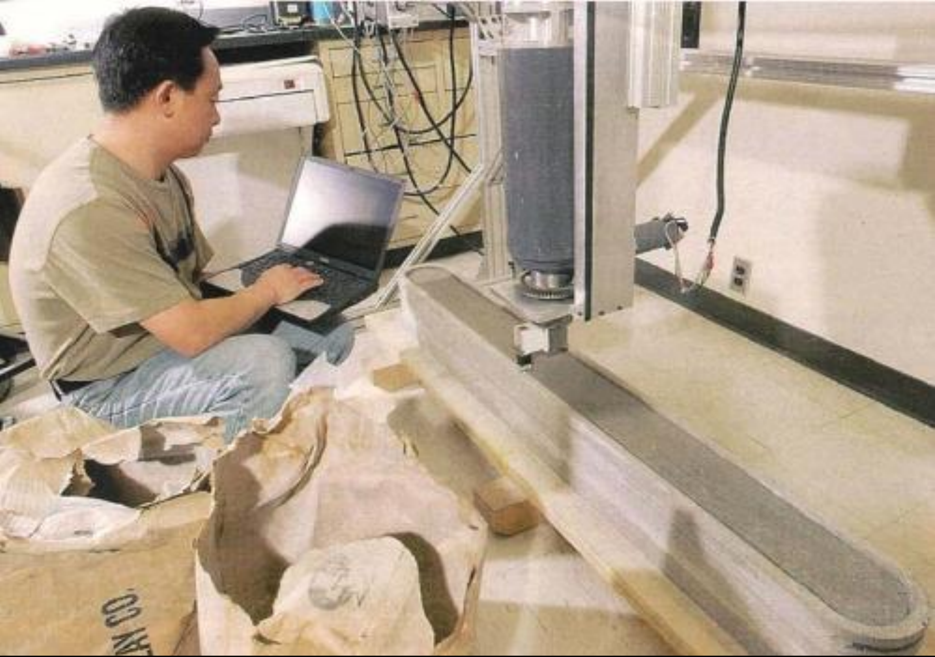
Experimenting with wall-printing technology