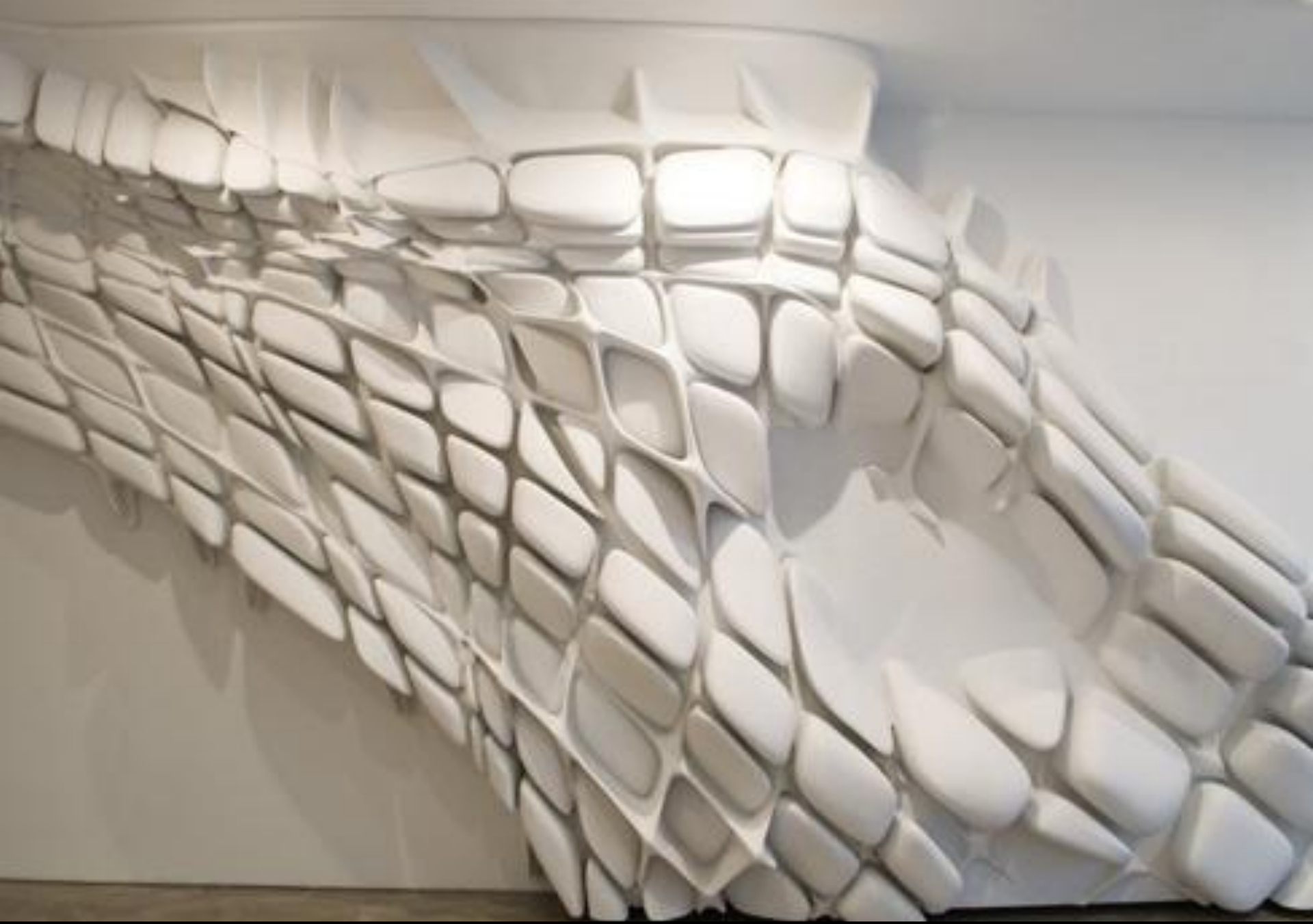
Free Form Design