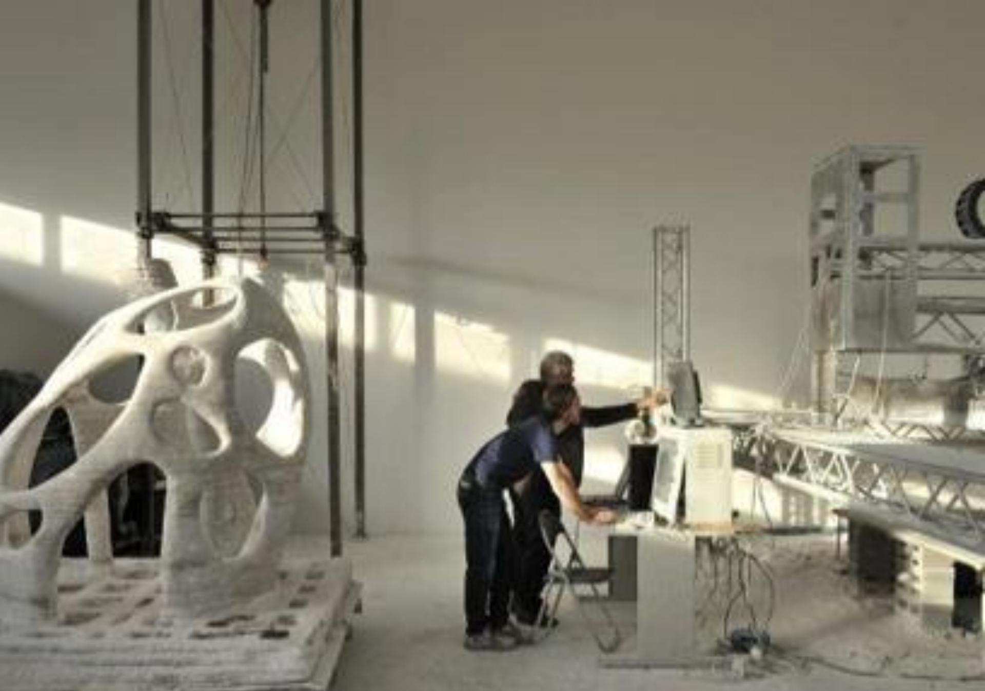
D-Shape – A printer capable of printing an entire building