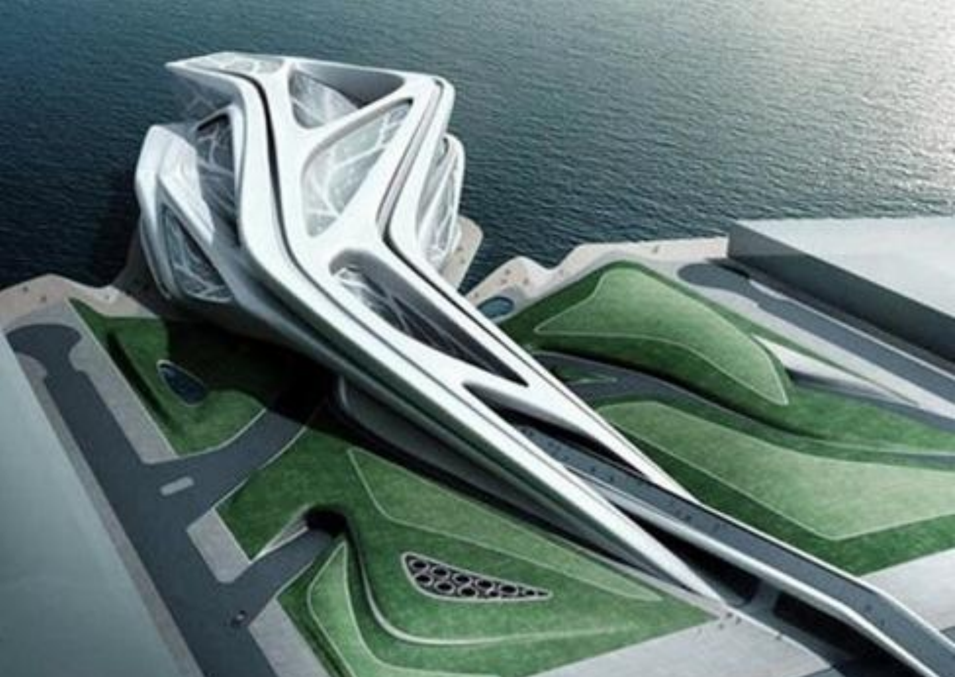
Free Form Design