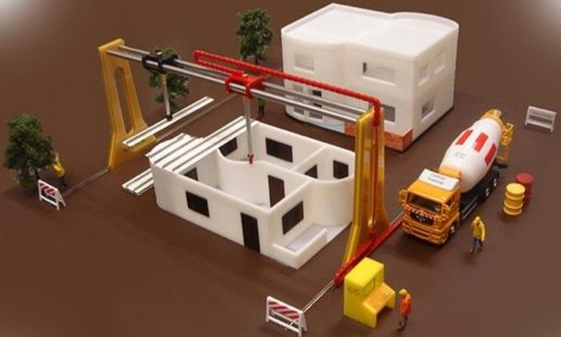
Printing houses – Thinking three-dimensionally