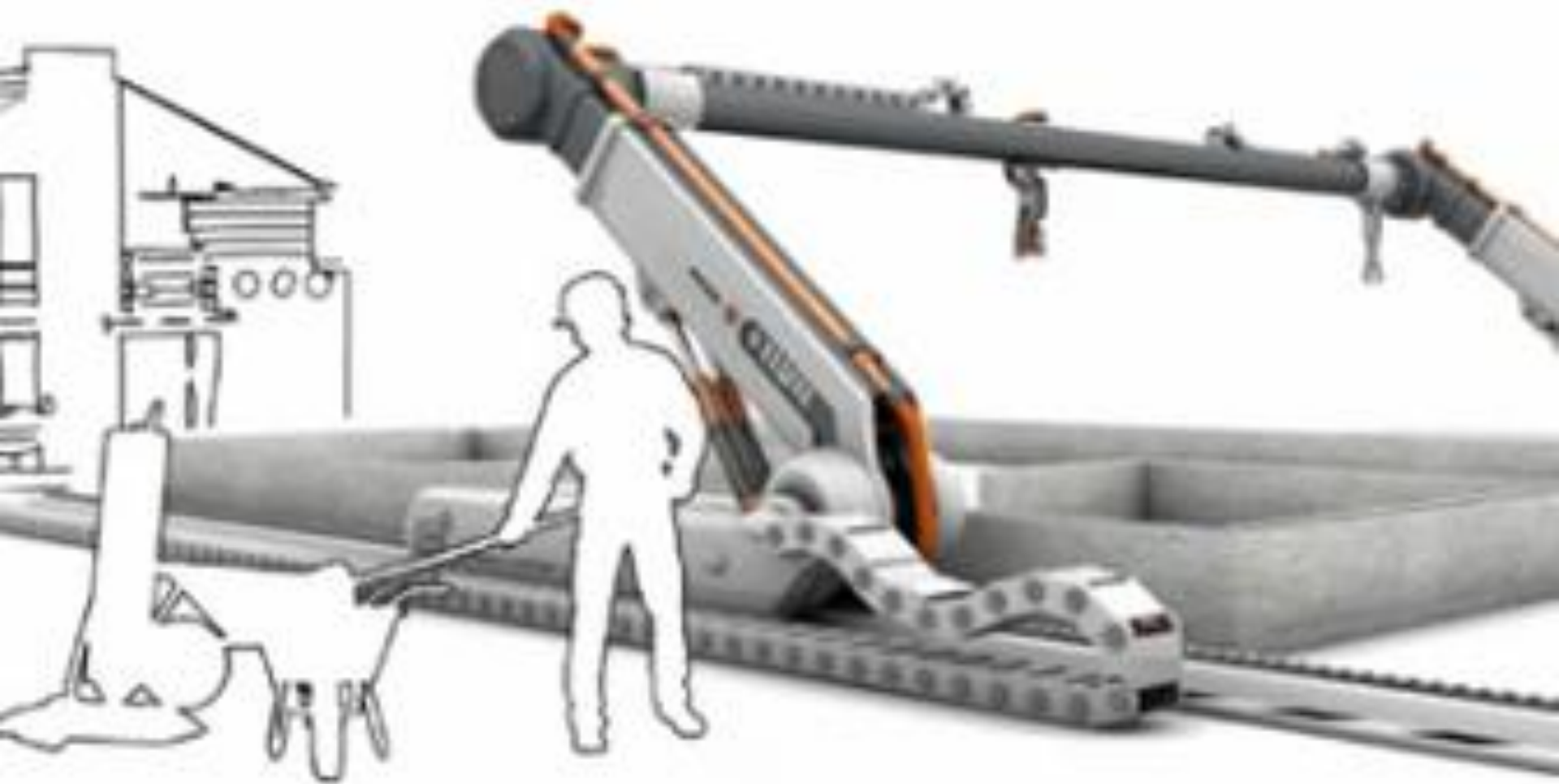
Imagining what a house-printer could look like