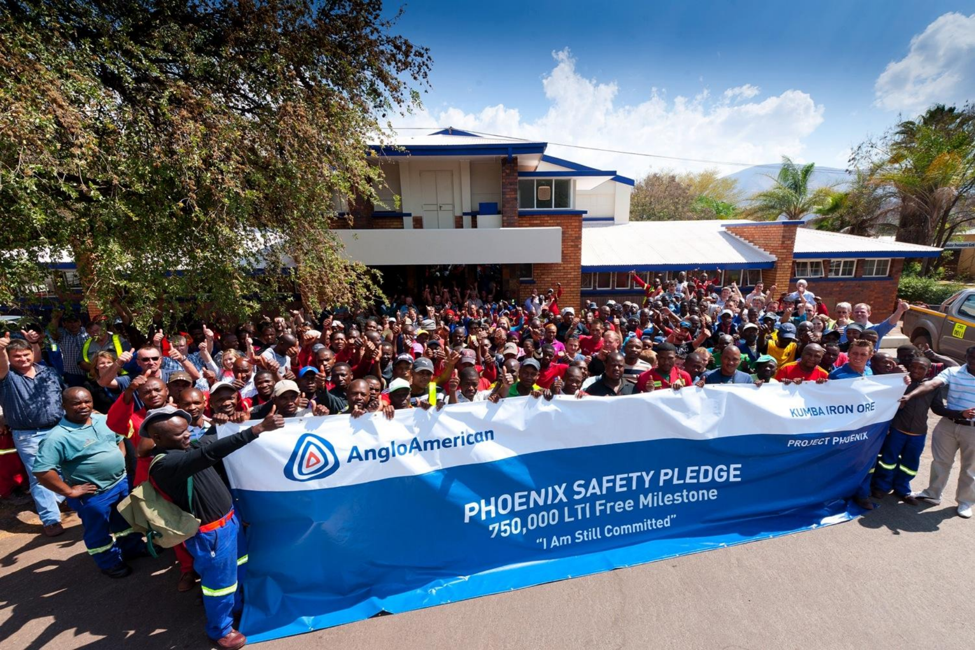
Milestone achievement celebrations