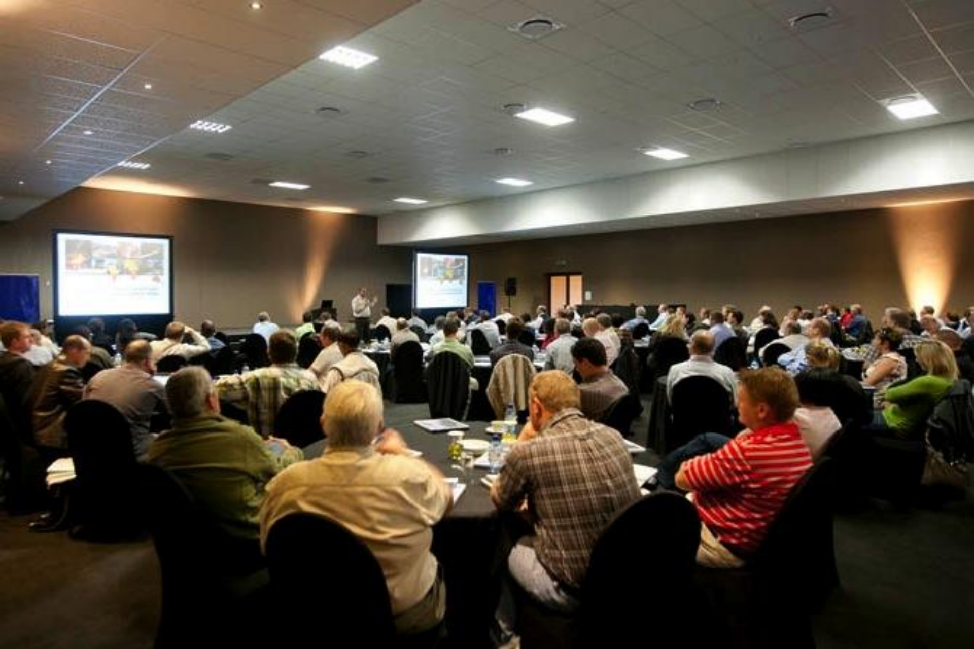
Re-enforcement of values