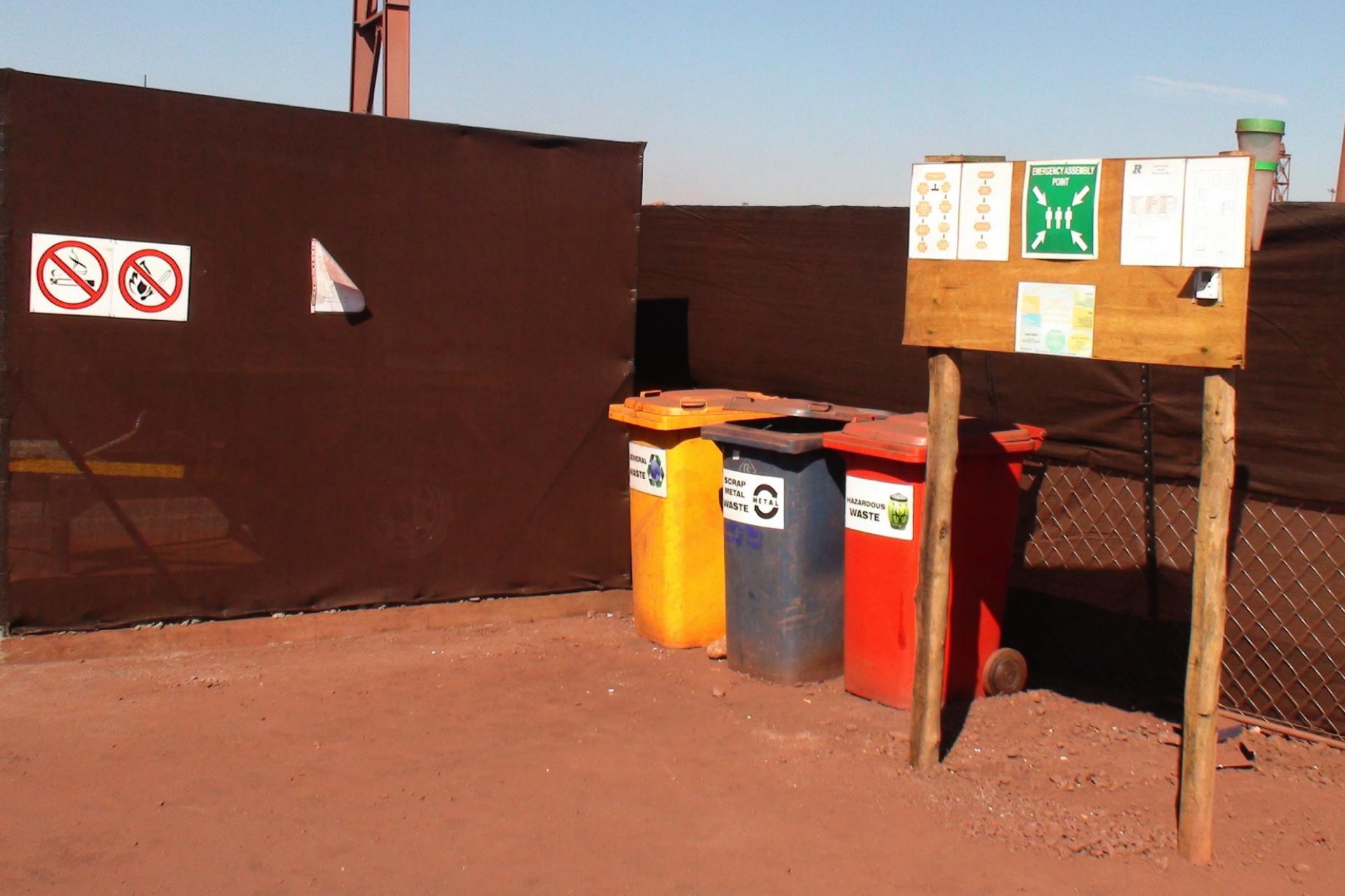
Sites quality creates first impression