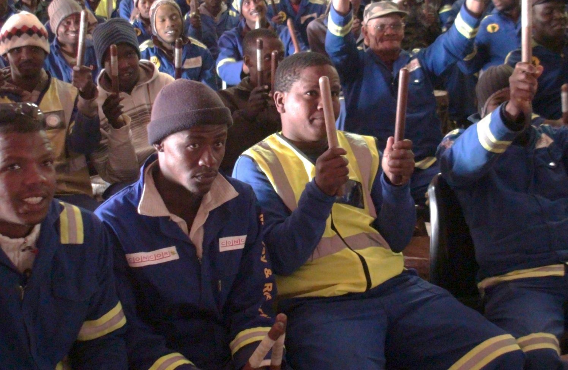
Culturally relevant motivational events