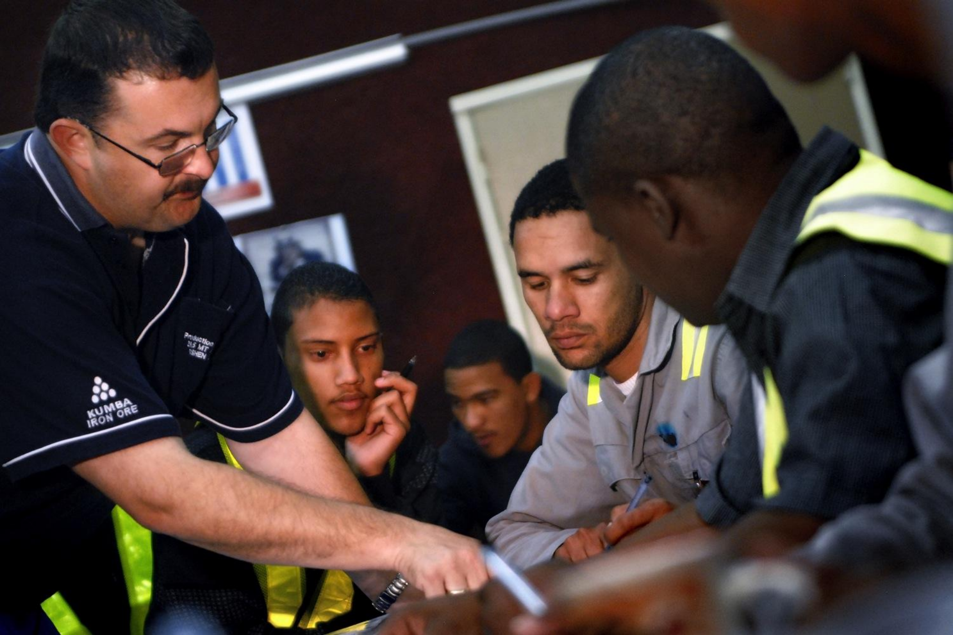
Safety Training integration