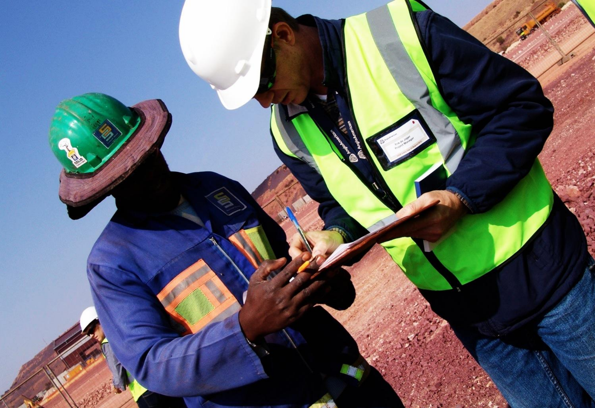
Safety risk management at all levels