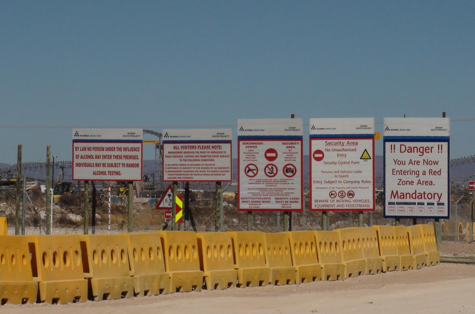
Sites quality creates first impression