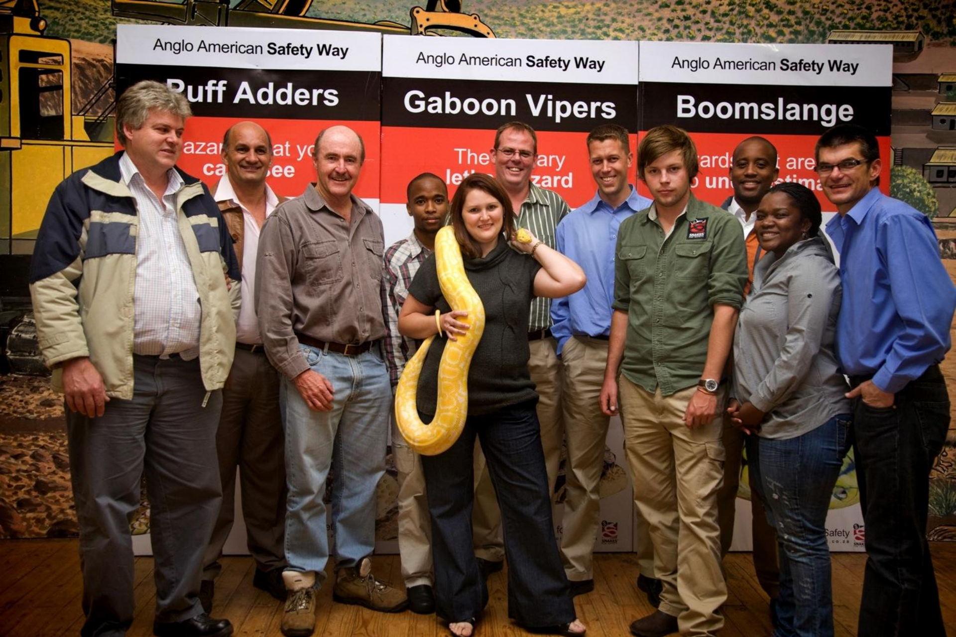
Snakes for safety