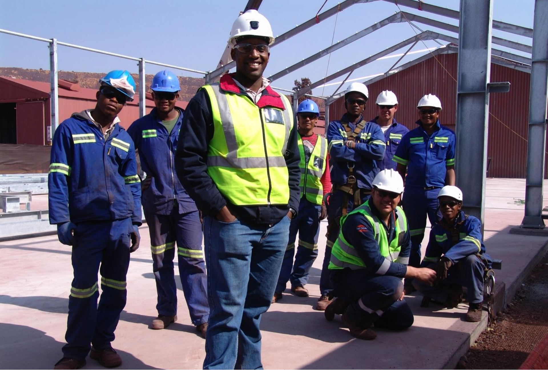
Professionals in training