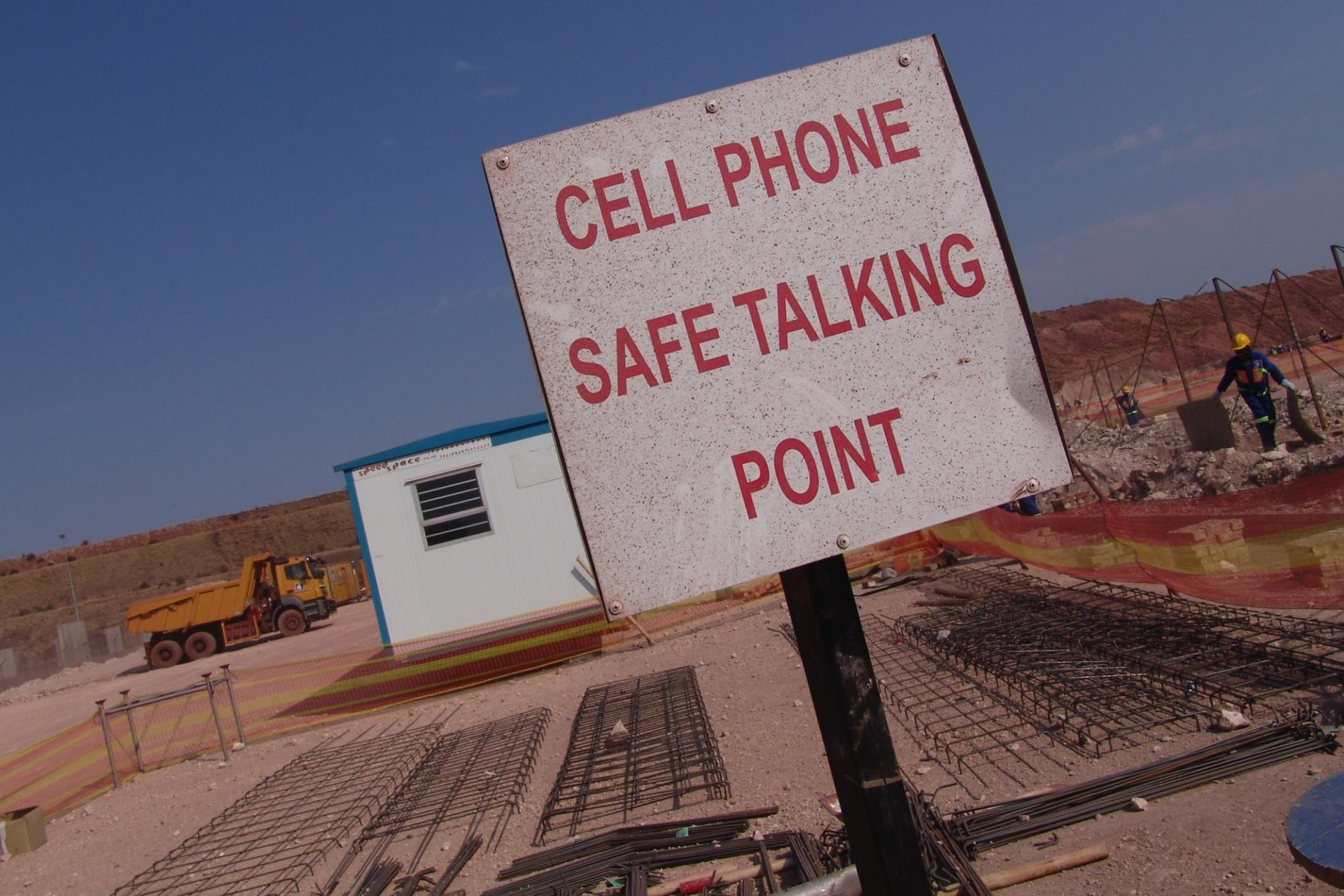
Sites quality creates first impression