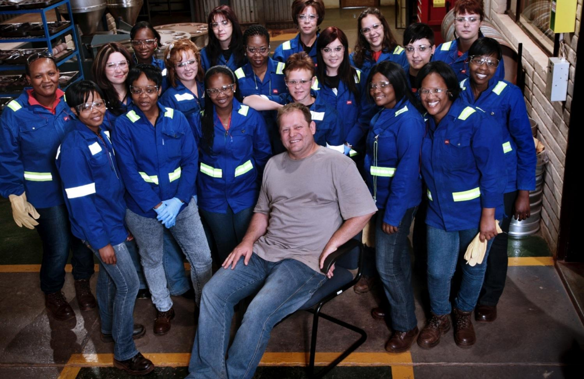
Women in mining